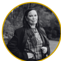
Debbie Ngarewa- Packer Te Pati Maori Te Tai Hauāuru