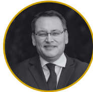
Shane Reti National Whangārei