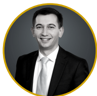
Simeon Brown National Pakuranga