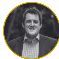
Chris Bishop National Hutt South