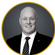
Christopher Luxon National Botany