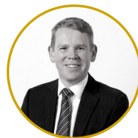
Chris Hipkins Labour Remutaka