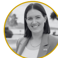
Brooke van Velden ACT Tāmaki