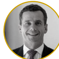
David Seymour ACT Epsom