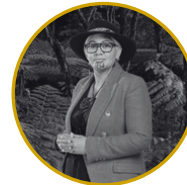
Takutai Tarsh Kemp Te Pati Māori Tāmaki Makaurau