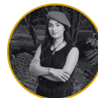
Hana-Rawhiti Maipi- Clarke Te Pati Maori Hauraki-Waikato