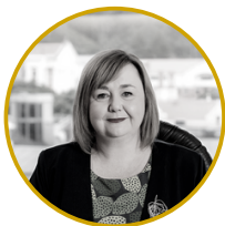
Dr Megan Woods Labour Wigram